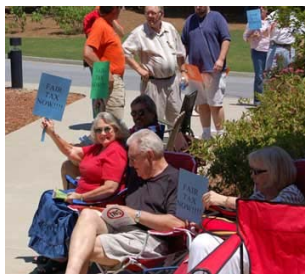
The line of enthusiastic supporters started forming early in the day. These dedicated folks endured a typical hot Georgia day to make sure they were part of the 4,500 to be allowed inside.