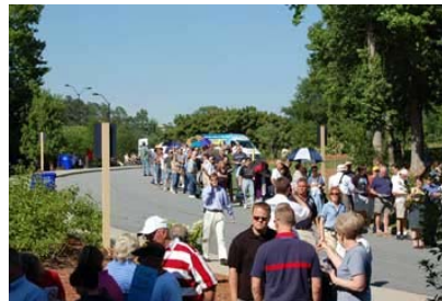
Regardless of the Georgia sun, the lines continued to form.