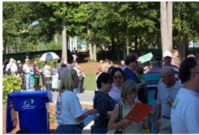
FairTax.org volunteers distributed information to the supporters waiting in line.