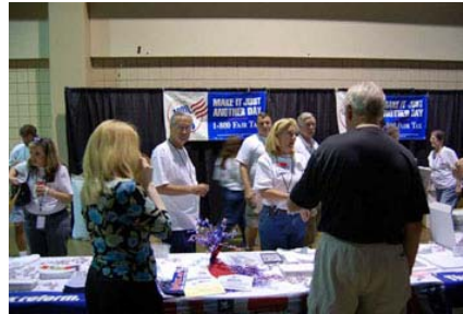
FairTax.org volunteers gave away T-Shirts, brochures, videos, CDs and more and encouraged supporters to get involved in spreading the word.