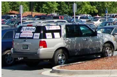
Pat Landy was one of the many supporters who drove or flew in from other states to support the cause! THAT is dedication to the cause!